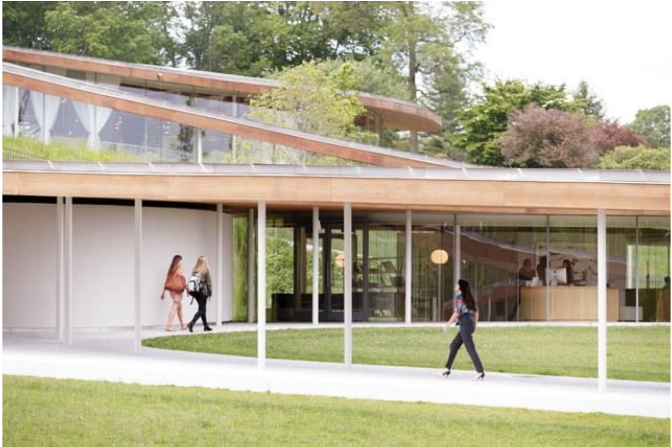
People stroll up the River.

Inside, there may be lights, but on a sunny day they aren't necessary, as Sanaa opted for ultra-clear windows as opposed to walls. For students looking to take a break from studying, there's an open basketball court, as well as an activity room with foosball and a flat screen. Free popcorn will be provided to students, as well as the not free, but delicious options at the cafe.