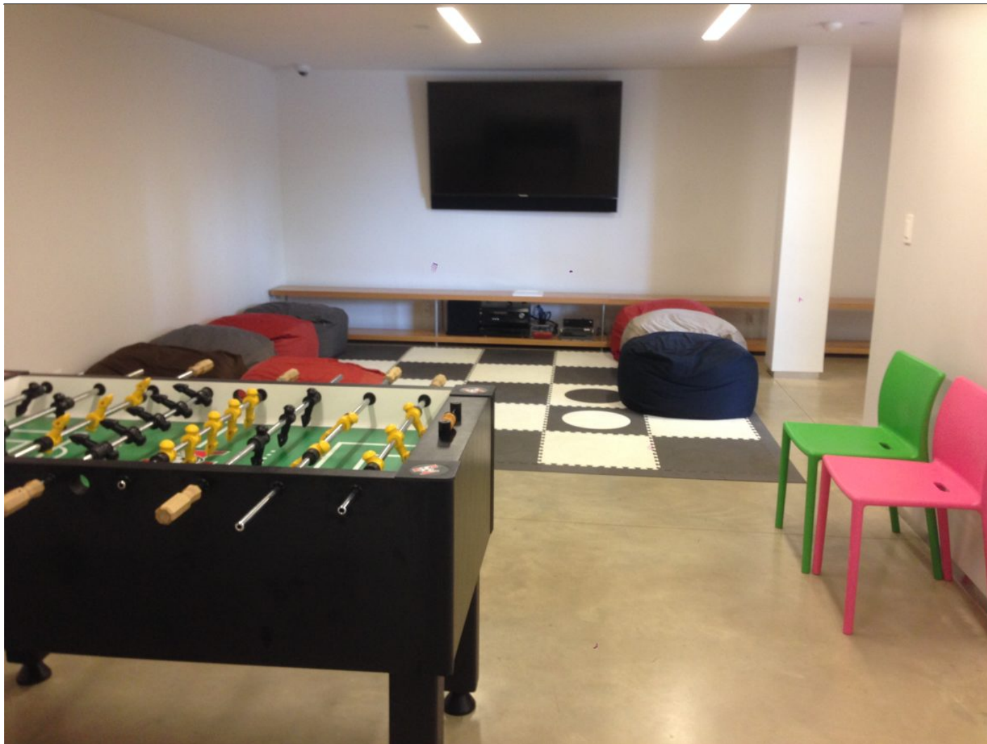
A look inside the activity room.