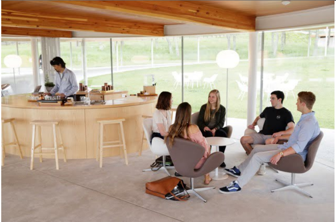
Students working in the commons.