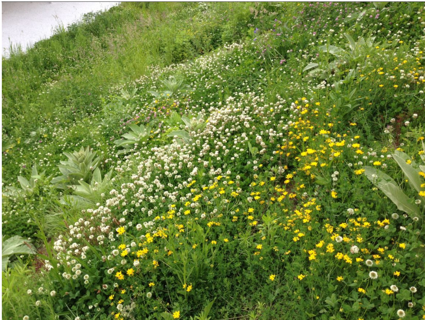
All life at Grace Farms is native to Connecticut, including these wildflowers.